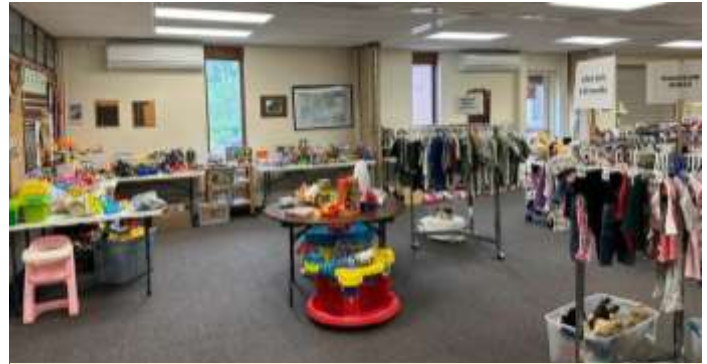
Everything for children was carefully arranged to sell