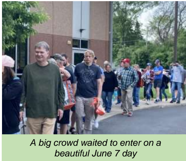
A big crowd waited to enter on a beautiful June 7 day